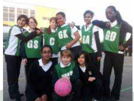
Year 7 & 8 Netball Team.