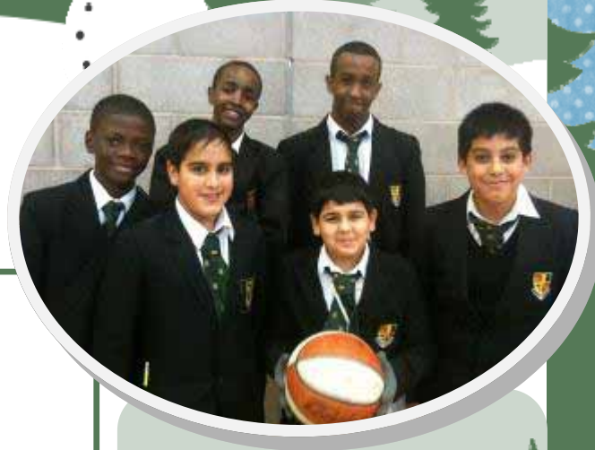
KS3 Boys Basketball Team.